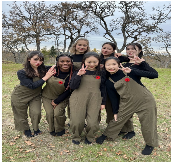
We had our beginner dance class perform in nature!