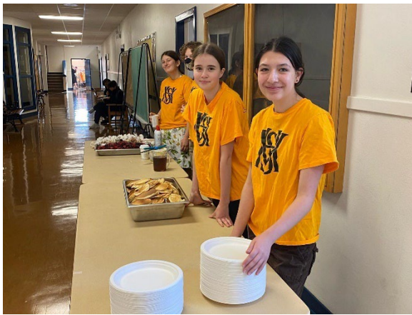
This year's grade 12 Leadership students with Ms.