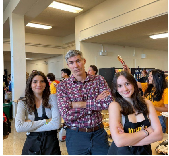
First Grad Assembly for the Grad Class Of 2024 was on September 14.