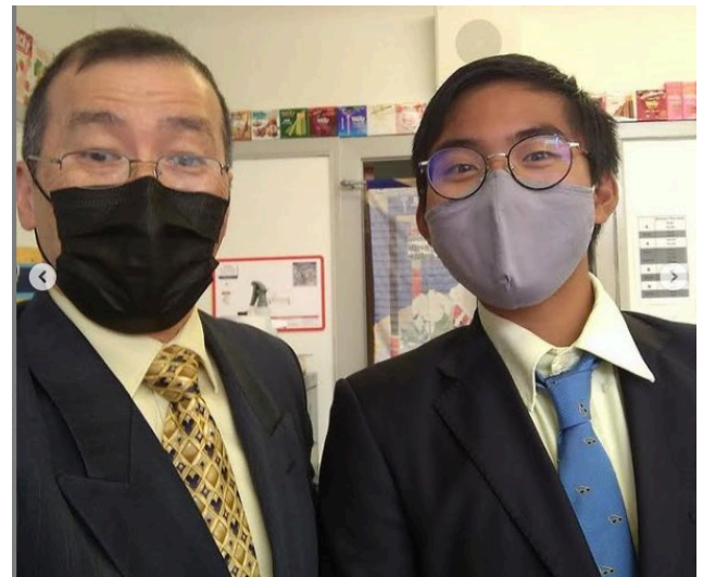
Grad Spirit Week