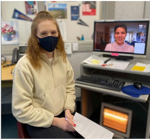
Students participated in 'Dream It Be It', a career support seminar for girls held in our Career Centre