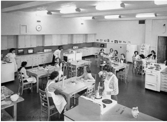
Same classroom. 70 years difference. SJ Willis - in the 1950's above and currently in 2020- Below photo is a combination class of Textile Studies 11/12 with Fashion Industry 12 taught by Ms Adamschek