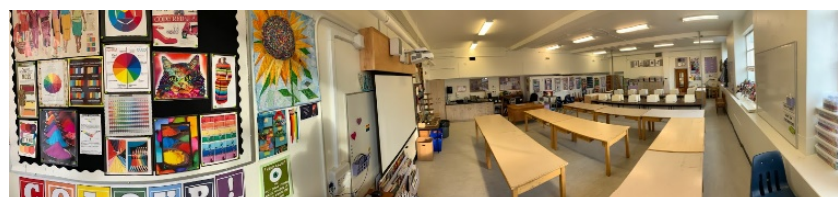
The unpacked Textile Studies classroom here at now at our Topaz Campus