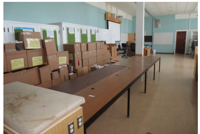
The packed up Textile Studies classroom back in June at our Fernwood Campus