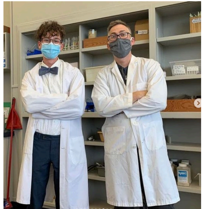
Grad Spirit Week