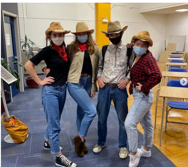
Grad Spirit Week