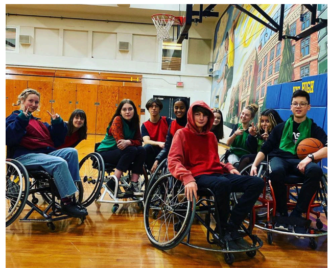
Education Physique 9/10 with Victoria Wheelchair Basketball #wearevichigh