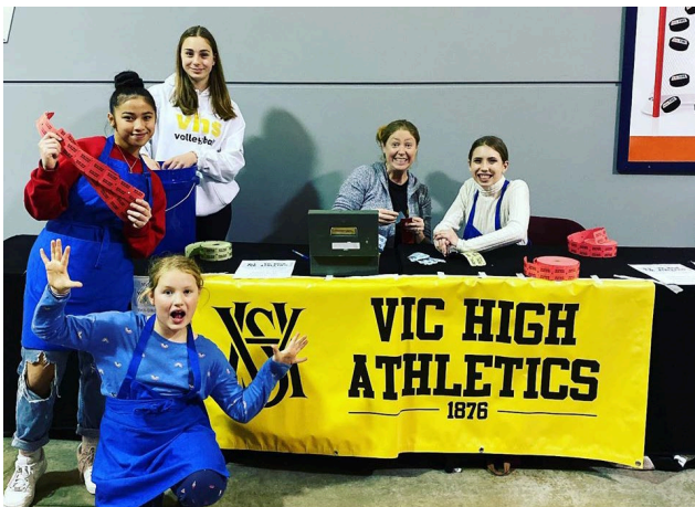
Vic High Girls Volleyball selling 50/50 at Victoria Royals Game #wearevichigh