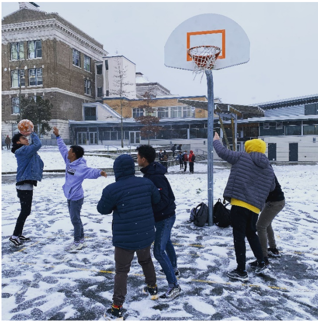
Boys basketball team getting some extra practice in the snow