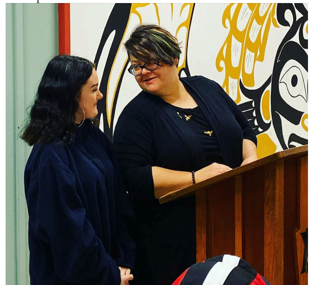
Congratulations to all those students who were recognized in our Breakfast of Champions in December