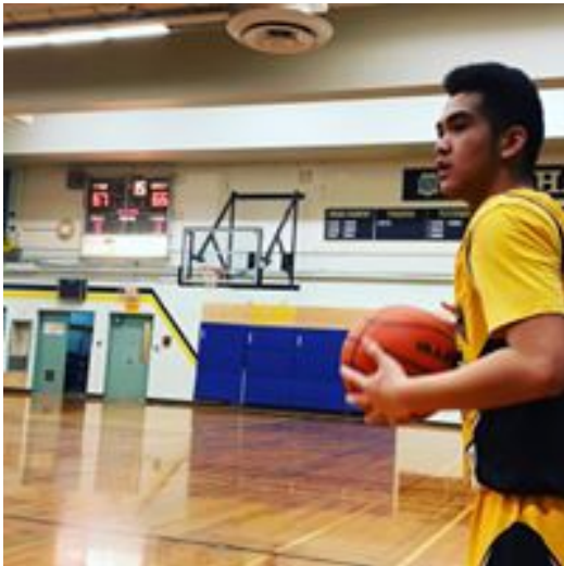
Our Jr. & Sr. Boys Basketball teams are competing for an opportunity to play at the Island Championships in February